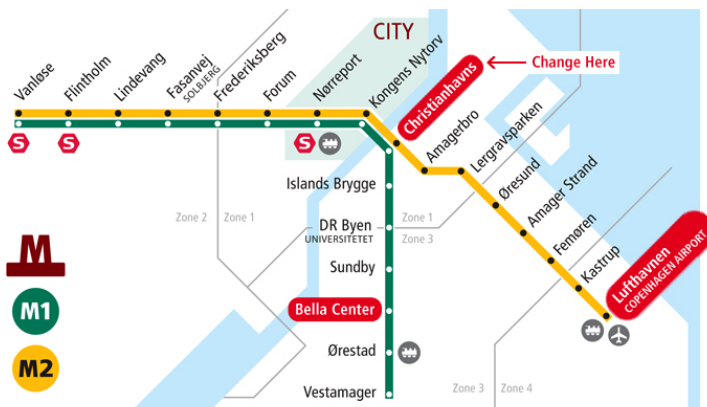
The Copenhagen Metro has two lines which run from suburban Vanløse to Vestamager and Copenhagen Airport, both situated on the island of Amager. The Metro runs 24 hours a day, every day of the week.

More information available at www.m.dk .