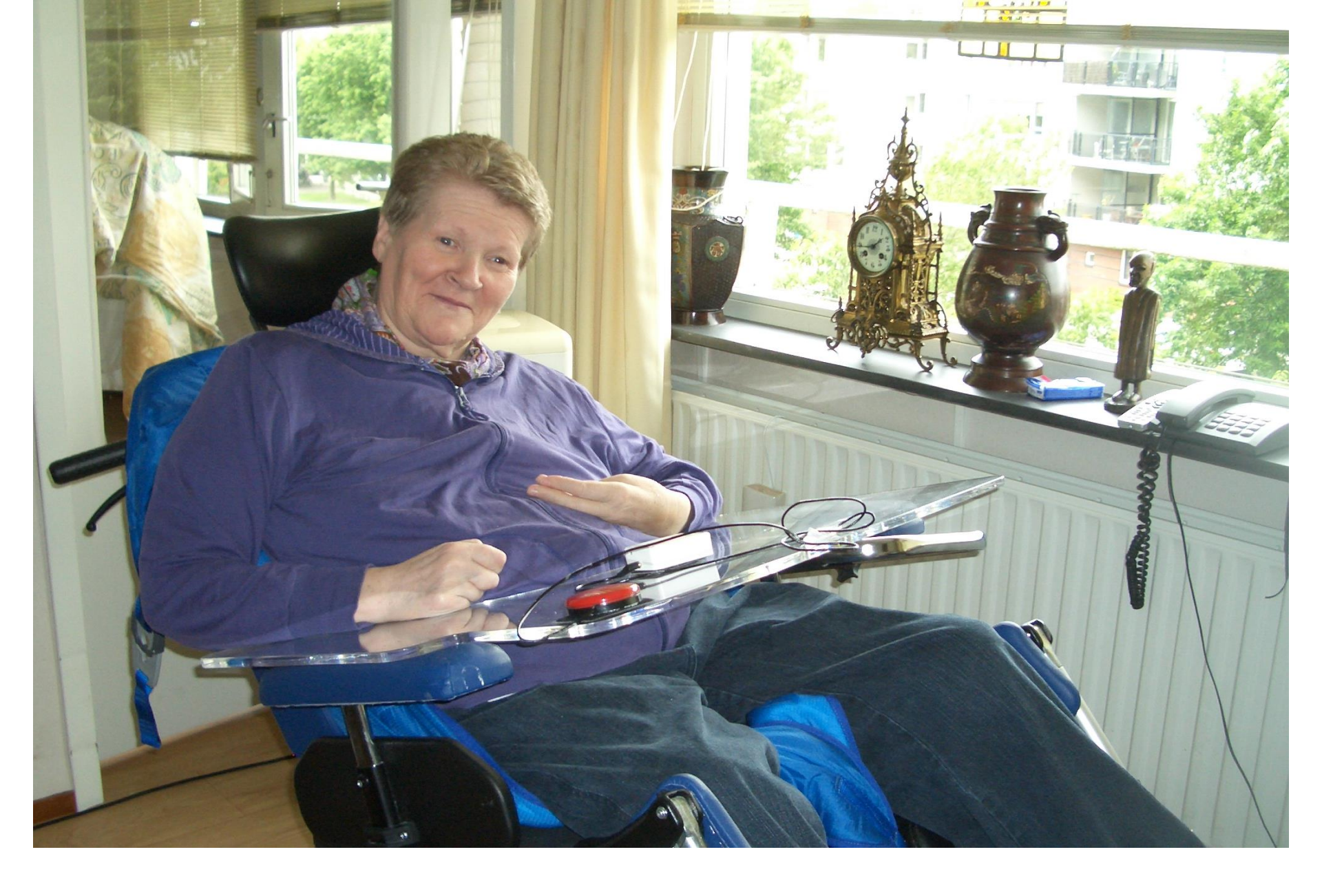
Humanitas, NL- nursing home level care in her own apartment