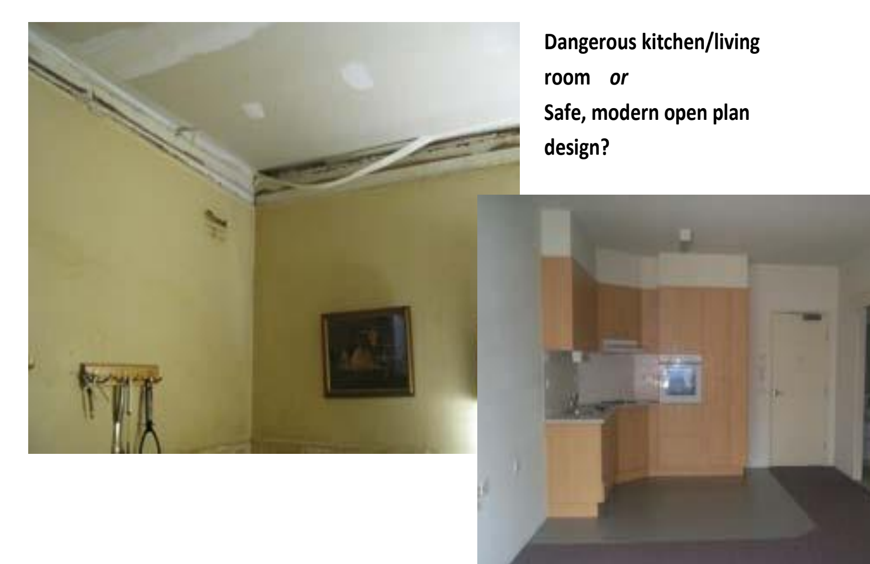
Housing for the Aged Action Group Inc (HAAG), Policy Platform, Victorian Election, 2014