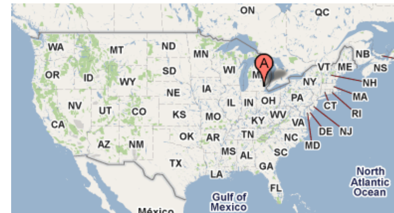
Ann Arbor, MI