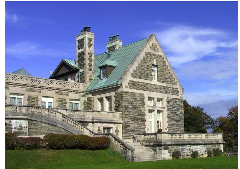
Arden Villa, Orange County, New York