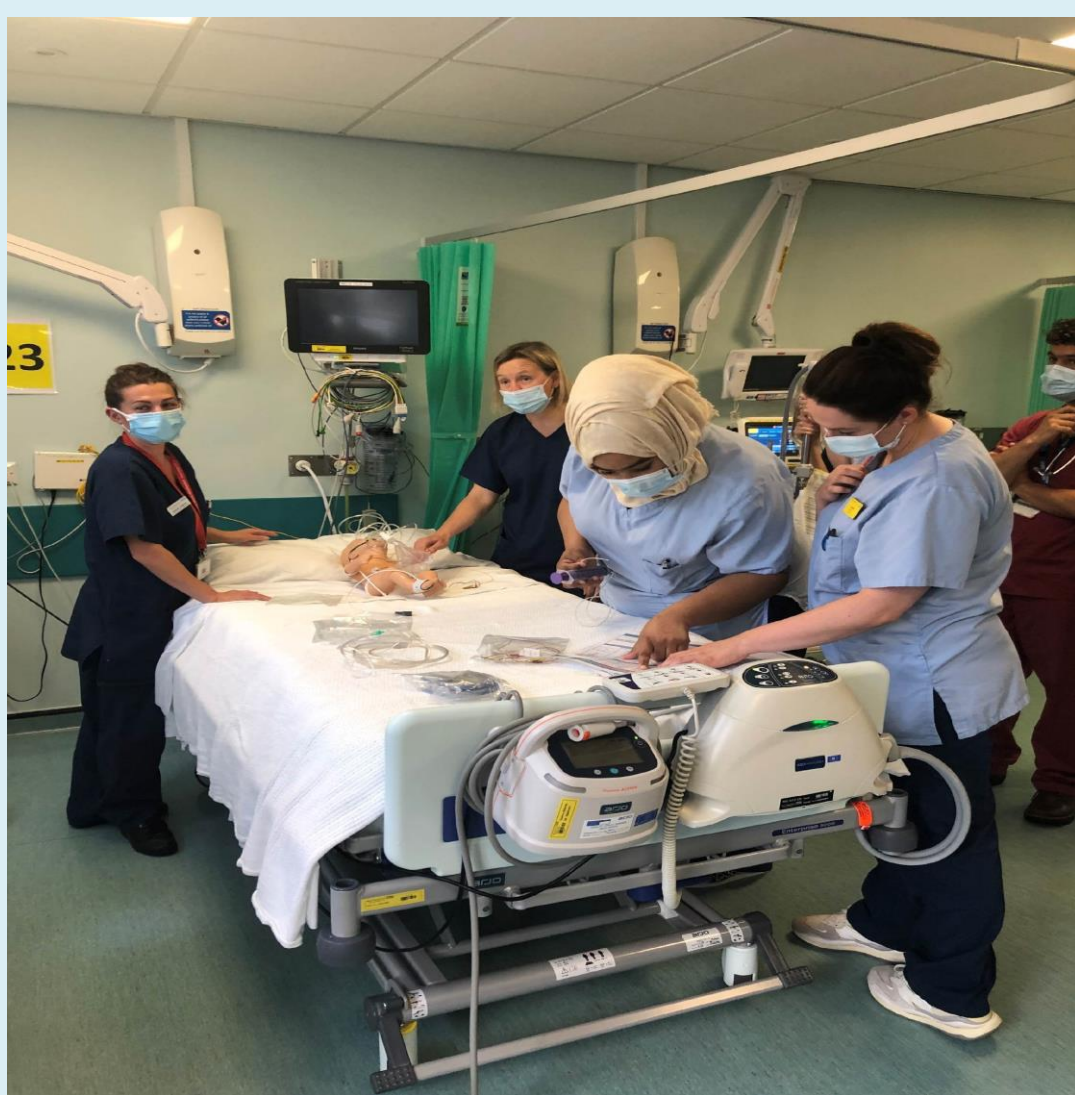
Figure 1: Team simulation

A team from the Adult Intensive Care Unit (AICU) and the Paediatric High Dependency Unit (PHDU) from the Royal Berkshire Hospital in Reading delivered an inter-professional teaching session focussed on caring for the sick child with bronchiolitis. The patient journey was utilised as a framework to teach the core knowledge, skills and attitudes needed to clinically manage a child from the Emergency Department (ED) to the Intensive Care Unit (ICU) to await retrieval to PICU. Each session included a lecture about bronchiolitis; a skills and drills tutorial; and a practical simulation scenario.