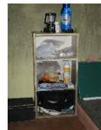
EMCDDA- overview on DCR's