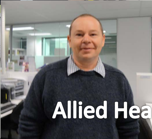
Allied Health Therapists