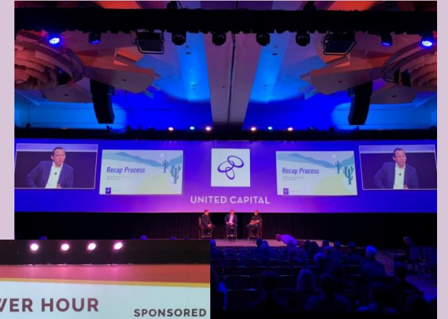
general session screen