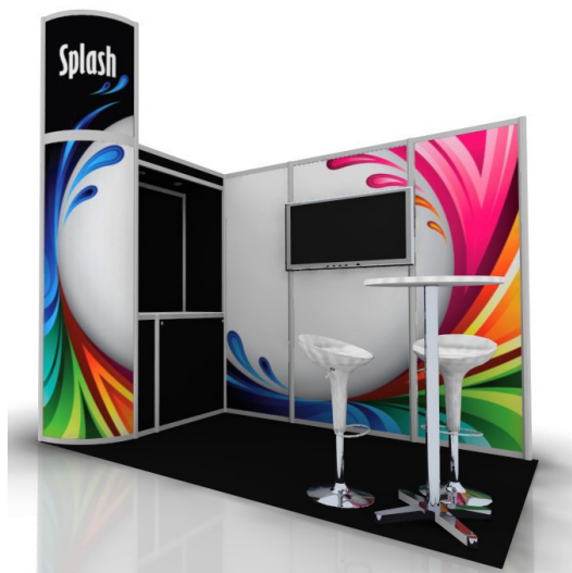
Custom Design & Build Stand @ 3m x 2m.

This option includes Custom Graphic Infills, Storage Counter, Plasma Screen, Black Carpet and Hire Furniture.