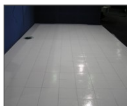
RAISED WHITE TILES