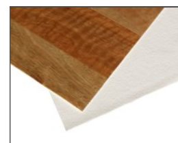
WOOD-LOOK or WHITE MDF