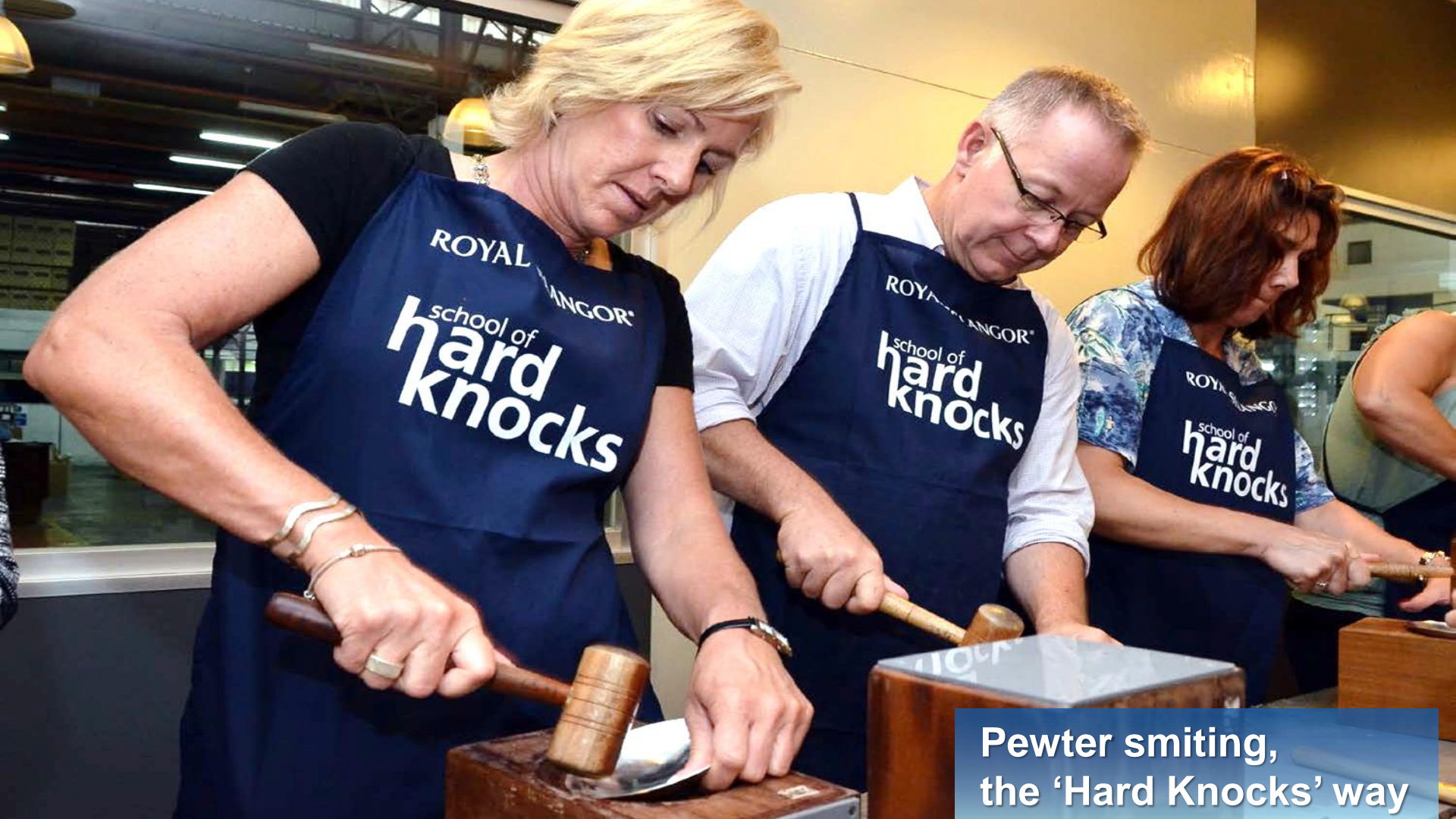
Pewter smiting, the 'Hard Knocks' way