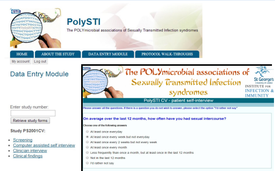
Fig.1. Screen shot of webpage and CASI

BV status was determined by Nugent scores from Gram-stained lateral vaginal swab smears.