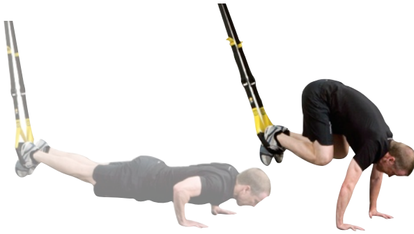
3. ST Atomic Pushup