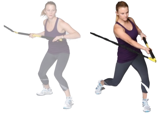
2. Rip Samurai Strike