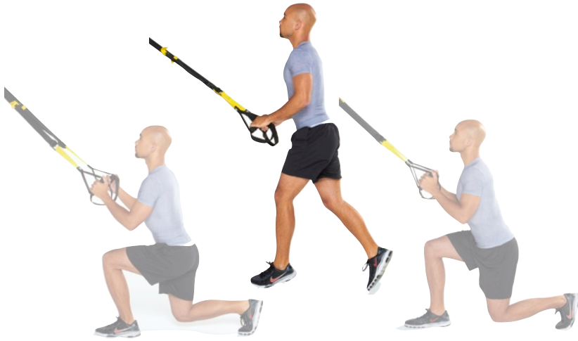
1. ST Cycle Jump