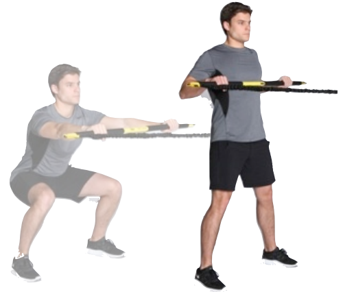
4. Rip Squat Row