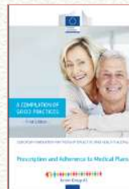
Compilation of Good Practices from Action Groups