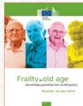
Frailty in old age Conferences, 2013 & 2014