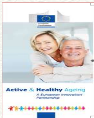
Leaflet on the EIP on AHA