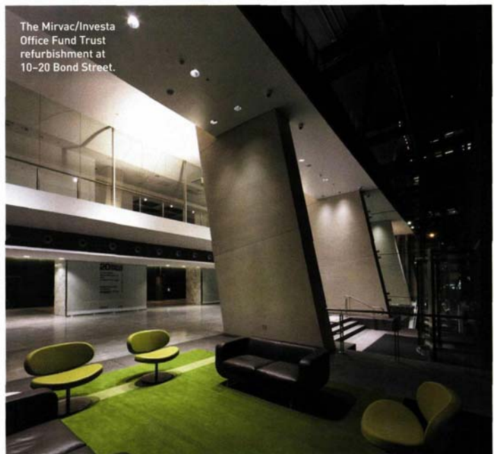
The Mirvac/Investa Office Fund Trust refurbishment at 10–20 Bond Street.