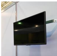
Audio and video equipment not listed on Form T2.2 may be provided at the request of the exhibitor.

For the additional features and combinations of a video wall, you can contact the technical manager.