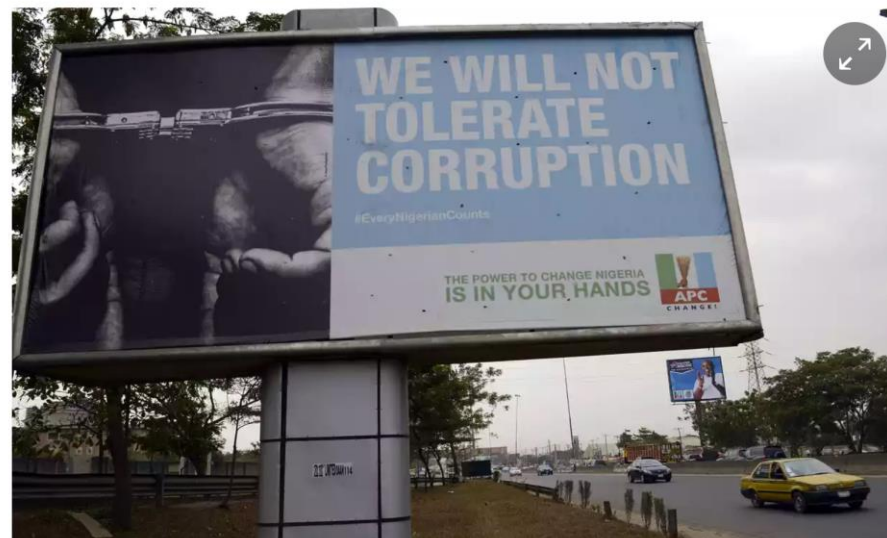
1 A party political billboard along a Lagos highway. Nigeria's crude oil exports are often mispriced, according to a

First African initiative to address illicit outflows says governments, multinationals and crime deprive poor countries of crucial services