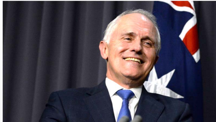
Prime Minister Hon. Malcolm Turnbull