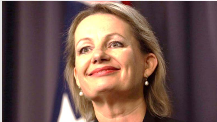
Health Minister Hon. Sussan Ley MP