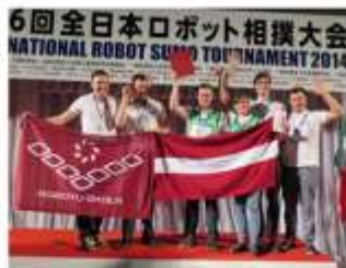
World Robot Champions