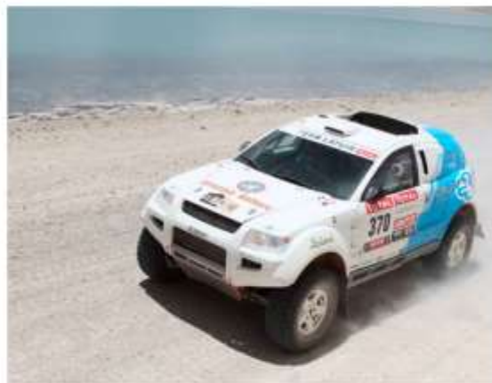
1st electric vehicle to finish the Dakar rally