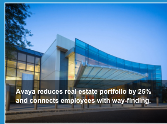
Avaya reduces real estate portfolio by 25% and connects employees with way-finding.