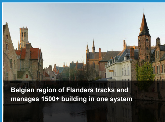
Belgian region of Flanders tracks and manages 1500+ building in one system

Evolve Your Workplace to Perform for Your People