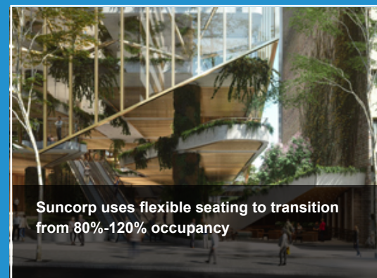
Suncorp uses flexible seating to transition from 80%-120% occupancy