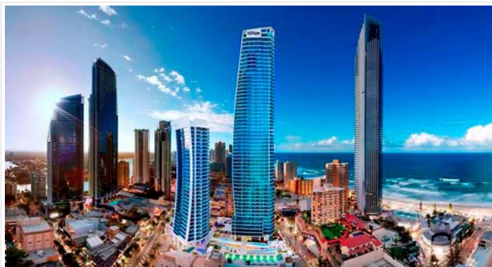
Hilton Surfers Paradise was presented with the Ryan Lawyers Award for Best Tourism and Leisure Development.