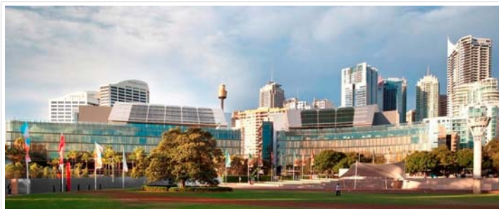
Lend Lease Darling Quarter, a 1.5-hectare development featuring a family playground, retail terrace, children's theatre and community green space.

"Lend Lease has transformed an under-used part of the CBD into a dynamic destination for the community to enjoy, while also providing a world-leading office environment for 6,500 CBA employees," Verwer says.