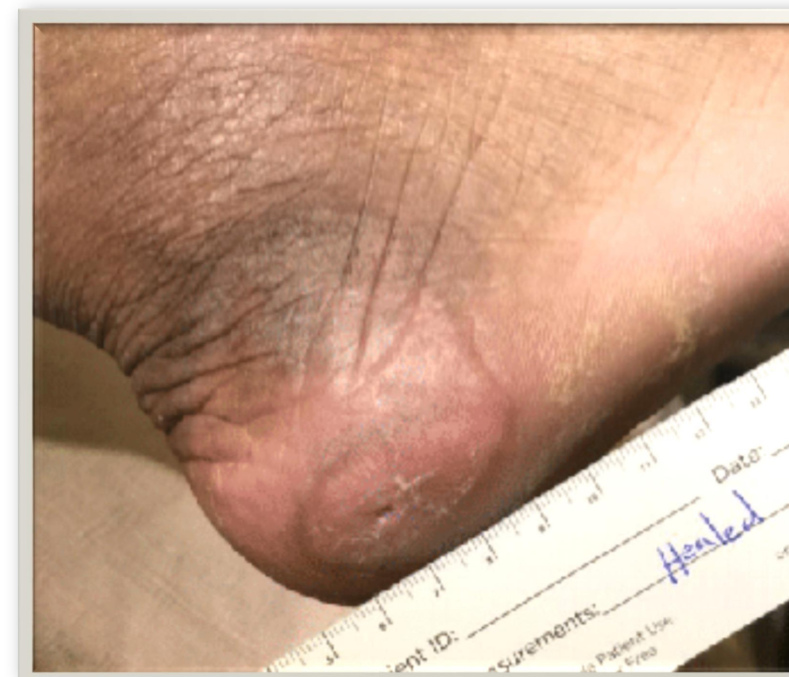
Figure 4: After 2 applications of PalinGen® Hydromembrane the wound epithelized and healed in less than 5 weeks

At initiation of the PalinGen Hydromembrane® application, the wound had only decreased by 14% with local wound care post angioplasty. The wound was completely epithelized 5 weeks following PalinGen® Hydromembrane treatments. One week following the first application of PalinGen® Hydromembrane, the wound had decreased by over 28%. A second application was completed and continued dressings were performed weekly with calcium alginate and DSD. After only 2 applications and 5 weeks' time, the wound was completely epithelialized with mild overlying HPK. There were no adverse events or safety concerns associated with PalinGen® Hydromembrane treatments, and patient's wound site remains closed to date.