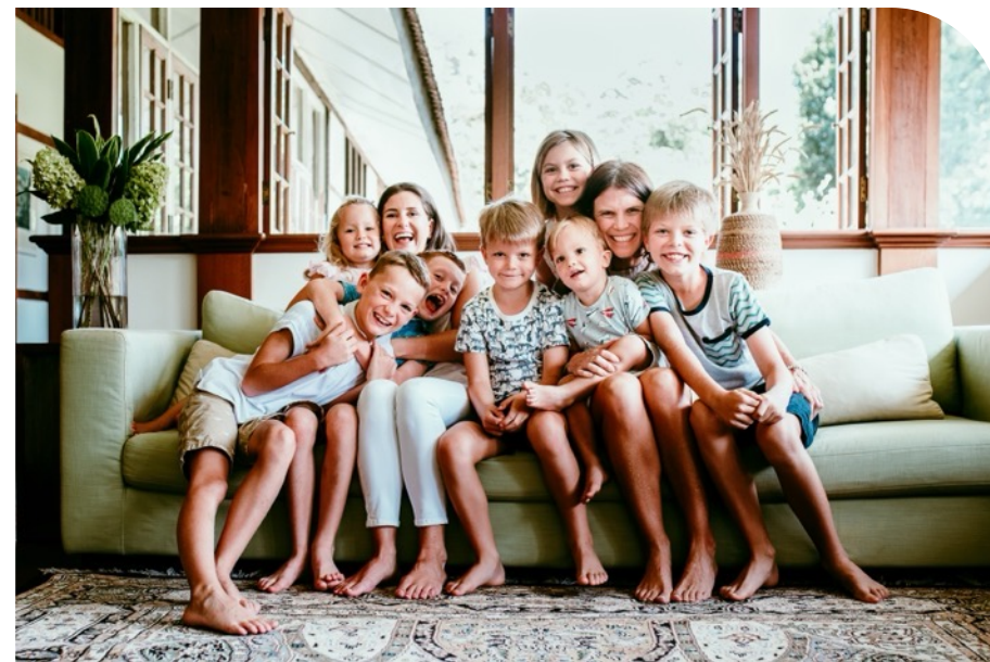
Akesi Co-Founders and their children