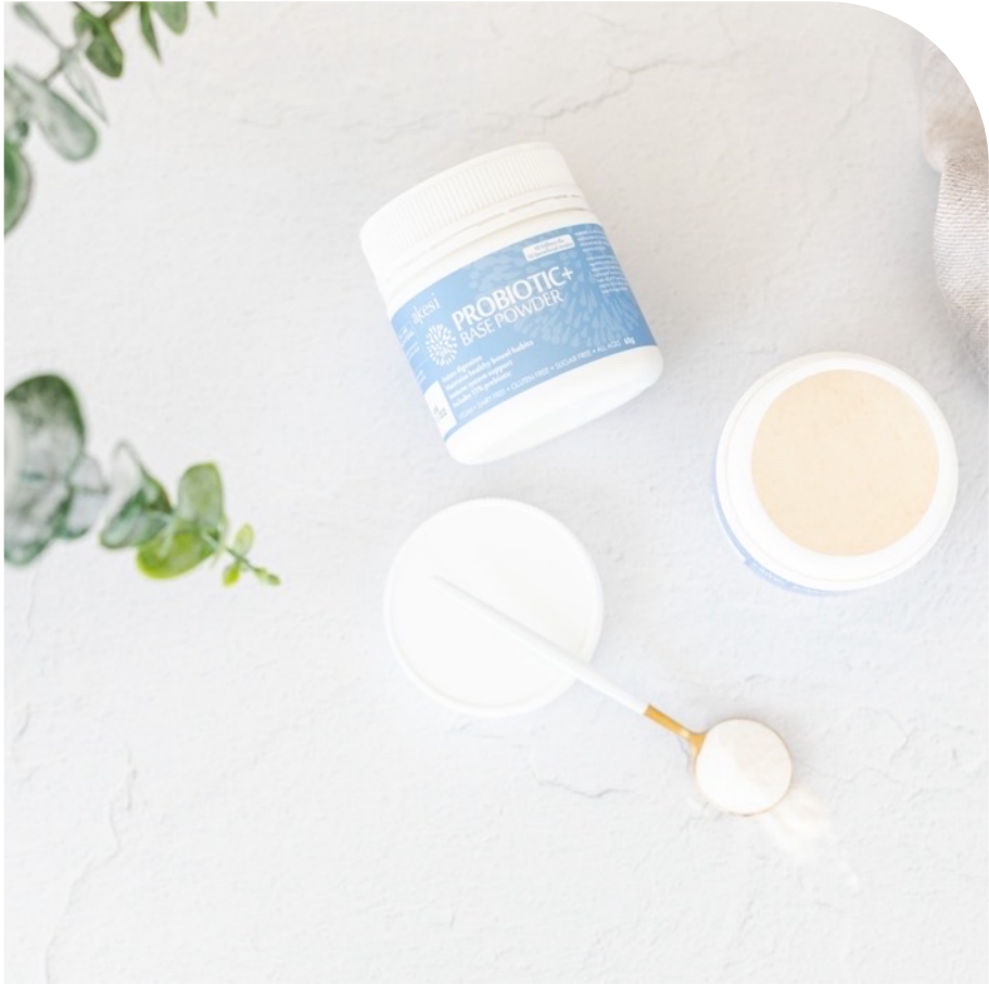
Assists digestive health, maintains healthy bowel habits and provides immune system support.