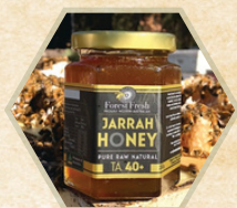
Forest Fresh branded