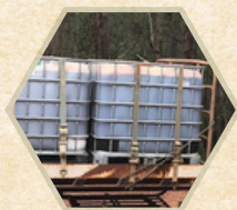
Bulk honey containers from 1kg to IBC