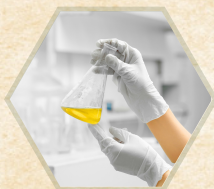
R&D of flavoured blends