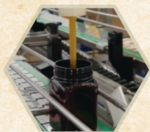
OEM/ private label