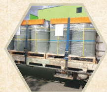
Custom bulk requests