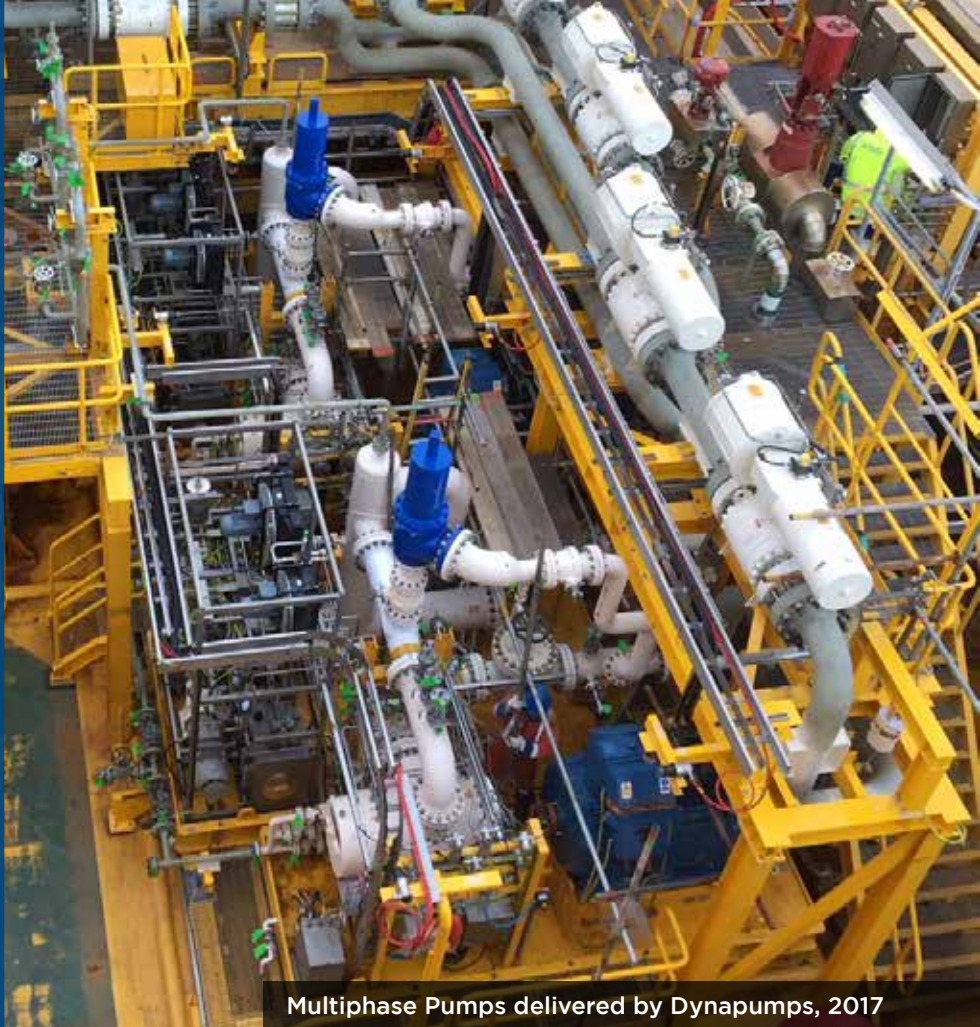
Multiphase Pumps delivered by Dynapumps, 2017