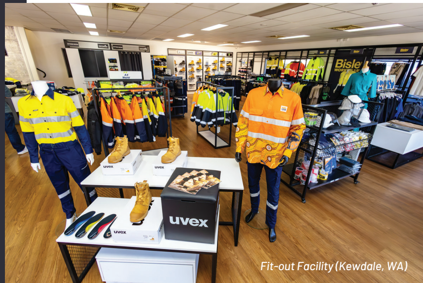
Fit-out Facility (Kewdale, WA)