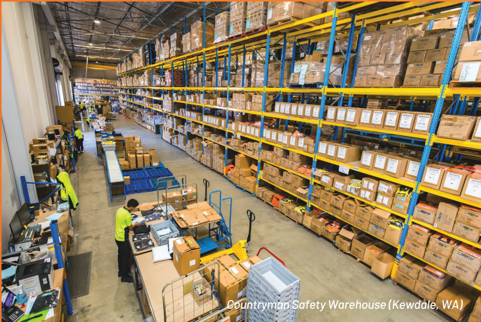
Countryman Safety Warehouse (Kewdale, WA)

At Countryman Safety, we firmly believe that PPE and workwear extend beyond mere commodities. Our focus is on delivering tailored solutions that precisely match the unique needs of your workforce. With our extensive capabilities and expertise, we stand ready to provide expert guidance and ensure that we not only meet but exceed your expectations.