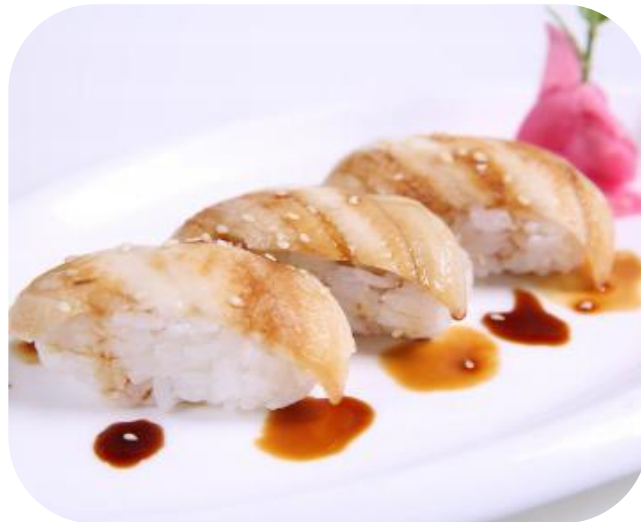
BOILED CONGER EEL SLICES