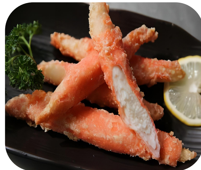
PRE-FRIED IMITATION CRAB STICK