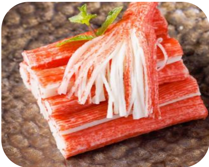
IMITATION CRAB STICK