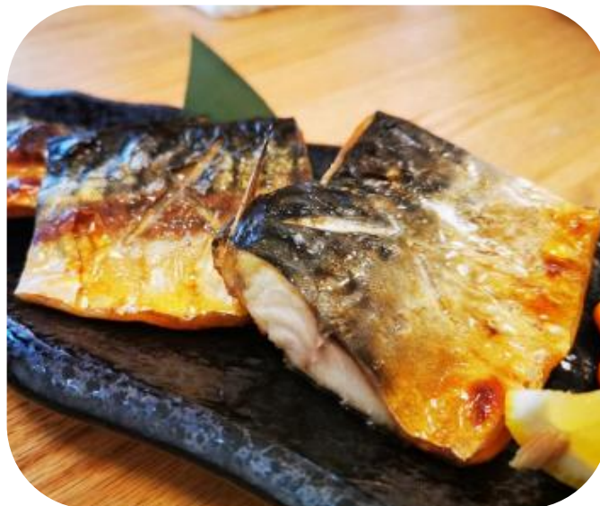
ROASTED SPANISH MACKEREL WITH SALT