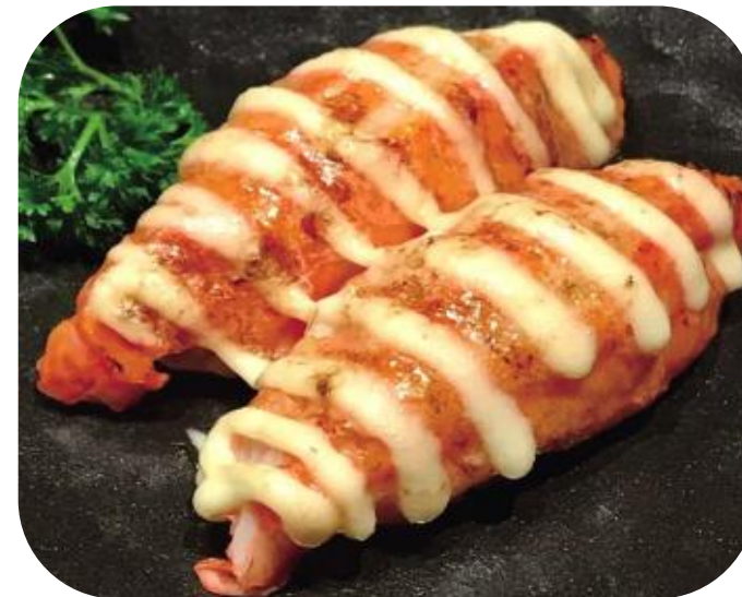
IMITATION KING CRAB MEAT