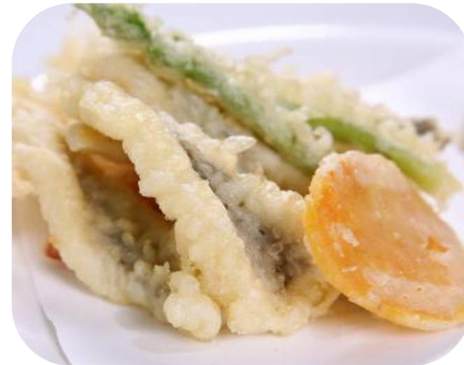
PRE-FRIED CONGER EEL SLICES