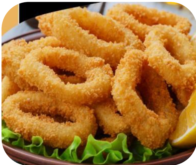
PRE-FRIED BREADED SQUID RING