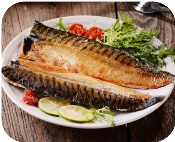
ROASTED MACKEREL WITH SALT