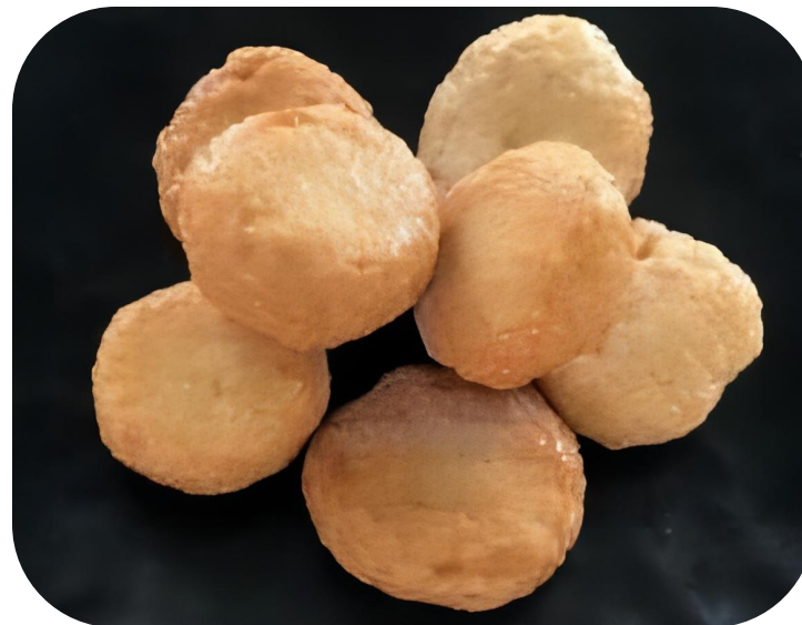
IMITATION FISH CAKE