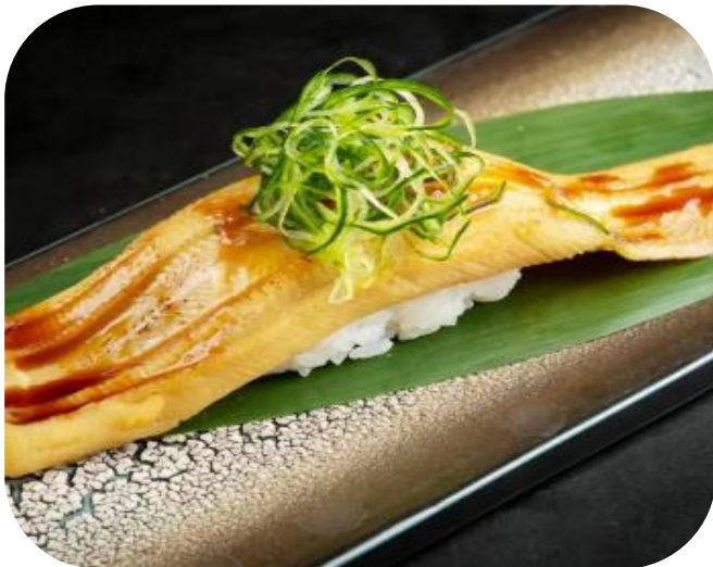
BOILED CONGER EEL FILLET