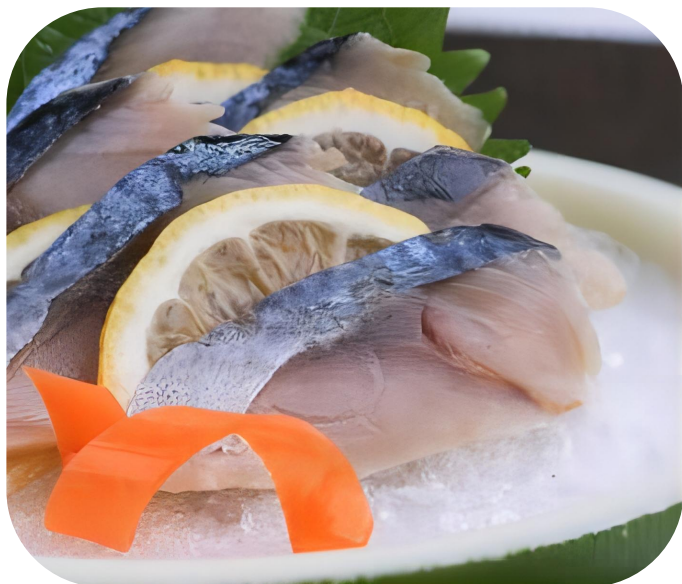
VINEGARED MACKEREL SLICES