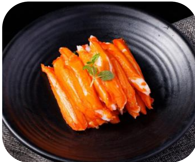
IMITATION CRAB MEAT