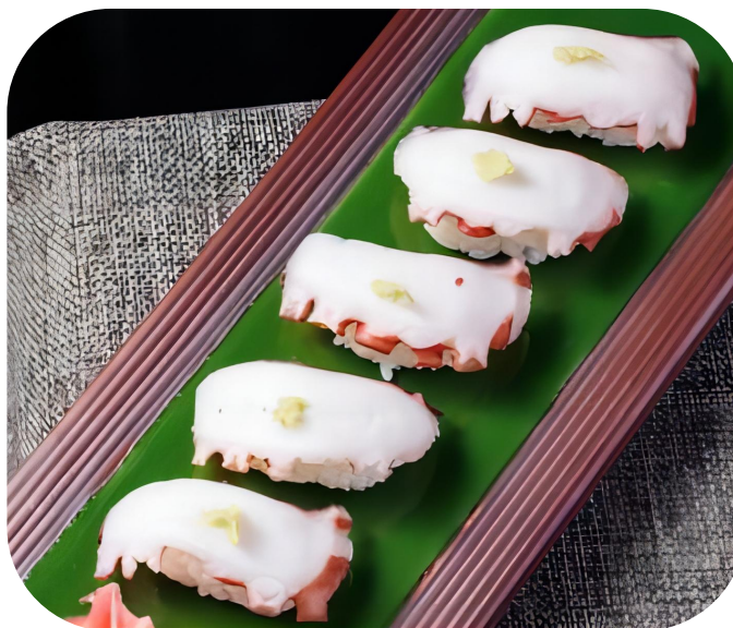
BOILED OCTOPUS SLICES