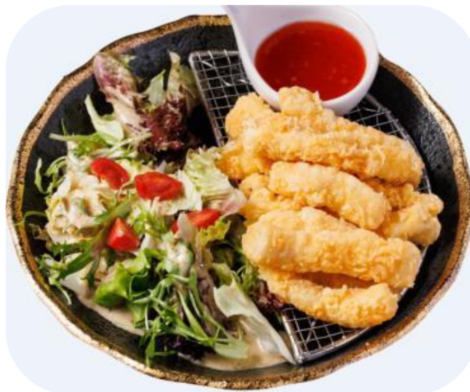
PRE-FRIED BREADED FISH FINGER