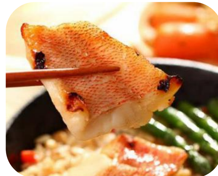
ROASTED REDFISH WITH SAUCE