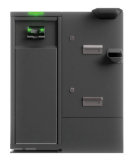
Back-Office Cash Recycler