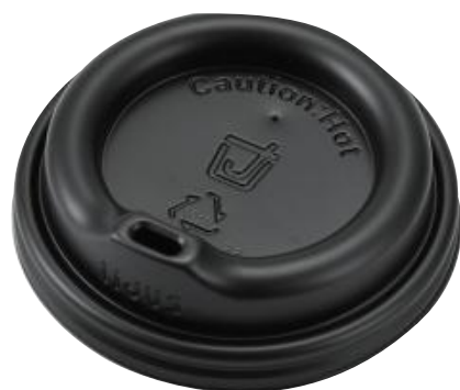
Product Name: PS Hot Cup Lid Applicable for: 8oz/10oz Paper Cup Outer Diameter: 82mm Product Height: 22mm Product Weight: 2.6g