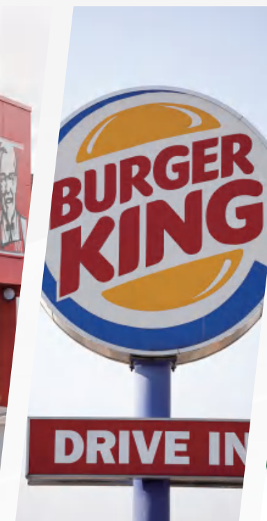
Burger King 汉堡王