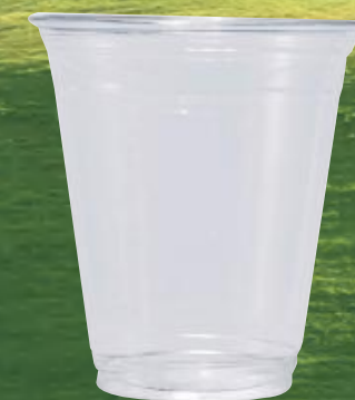
Product Name: 12oz PET Cold Cup