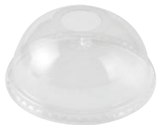
Product Name: PET Cold Cup Lid (Circular Hole)