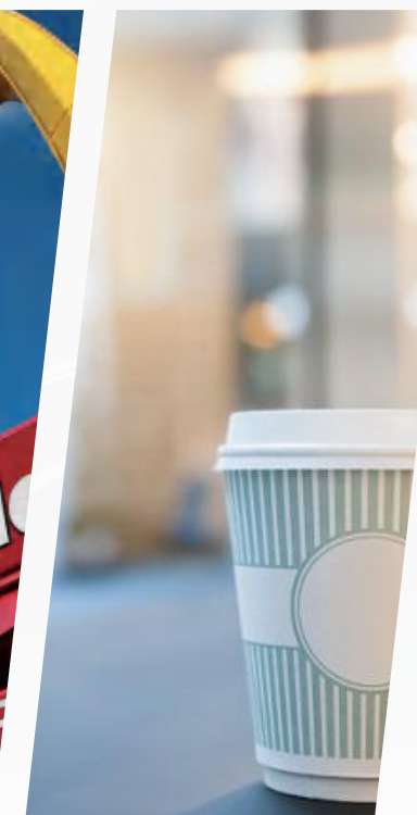
The Coffee Bean & Tea Leaf 香啡缤