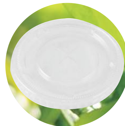
Product Name: PET Cold Cup Lid Applicable for: 12oz Paper Cup Outer Diameter: 92mm Product Height: 8.5mm Product Weight: 2.5g