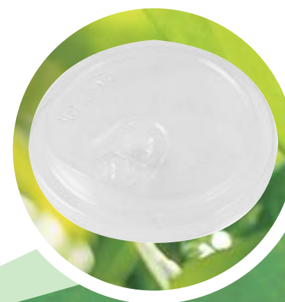
Product Name: PET Cold Cup Lid (Strawless) Applicable for: 12oz/16oz Cup Outer Diameter: 95.4mm Product Height: 19.2mm Product Weight: 3.5g