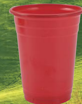
Product Name: 16oz PET Cold Cup