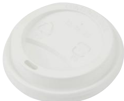
Product Name: PS Hot Cup Lid Applicable for: 12oz/16oz/20oz Paper Cup Outer Diameter: 91.5mm Product Height: 18mm Product Weight: 3.5g