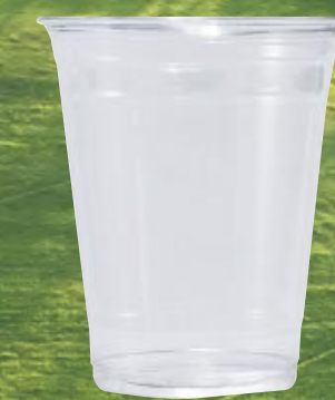
Product Name: 12oz PET Cold Cup