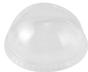
Product Name: PET Cold Cup Lid (U-Shape Hole)