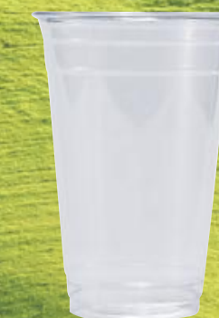
Product Name: 20oz PET Cold Cup