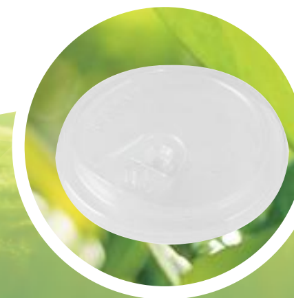
Roduct Name: PET Cold Cup Lid (Strawless) Applicable for: 16oz/20oz Cup Outer Diameter: 101.4mm Product Height: 19.1mm Product Weight: 3.9g