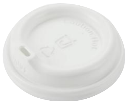
Product Name: PS Hot Cup Lid Applicable for: 12oz/16oz/20oz Paper Cup up Outer Diameter: 91.5mm Product Height: 24mm Product Weight: 3.7g