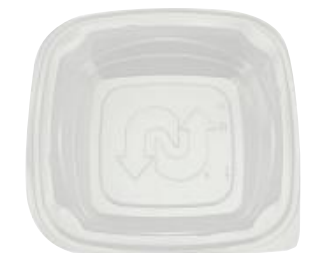
Product Name: PET Salad Lid