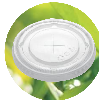
Product Name: PET Cold Cup Lid Applicable for: 12oz/16oz Cup Outer Diameter: 96mm Product Height: 9.5mm Product Weight: 2.5g