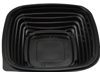
Product Name: PET Salad Bowl