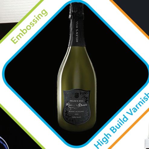
High Build Varnish