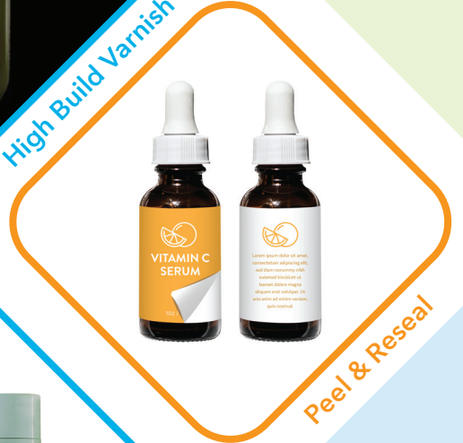
Peel & Reseal