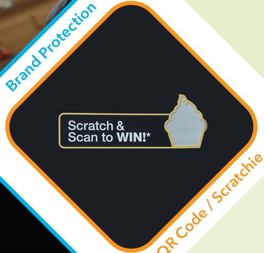
QR Code / Scratchie