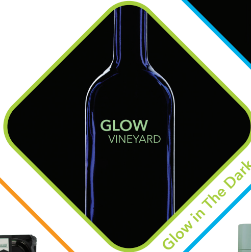
Glow in The Dark