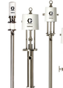
Sanitary Piston Pumps