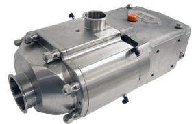
Universal Twin Screw Series