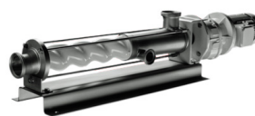
Progressive Cavity Pumps