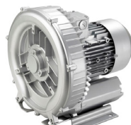
Side Channel Blower