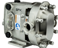
Universal 2 Series