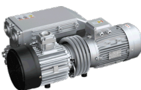
Rotary Vane Vacuum Pumps