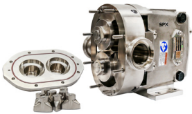
Universal 1 Series