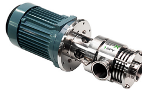
Darmix / Pentax In-line Mixers