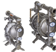
AODD Sanitary Pumps