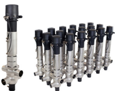
Double Seat Mix Proof Valves