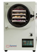
Food Freeze Dryers