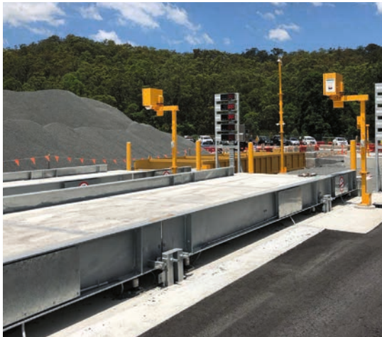
Weighbridges and axle weighing systems for Chain of Responsibility, mass management, and legal-for-trade operations.

We have a long and rich history within the industrial measurement space, with humble beginnings dating back to 1992 when our heritage brand Accuweigh was created, servicing Australian industry through the supply, installation, and service of industrial weighing solutions. Now, having evolved our capabilities to a broad range of industries, the solutions we offer cover customer requirements from Chain of Responsibility and mass management solutions for transport and logistics operations to product contamination prevention and quality control solutions for food manufacturers. We are also, through our heritage brand "Ultrahawke", Australia's oldest and most trusted weighbridge manufacturer.