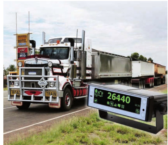
Onboard vehicle weighing systems for Chain of Responsibility, overload monitoring, and legal-for-trade operations.