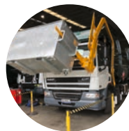
Waste Management & Recycling