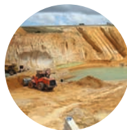
Energy & Resources