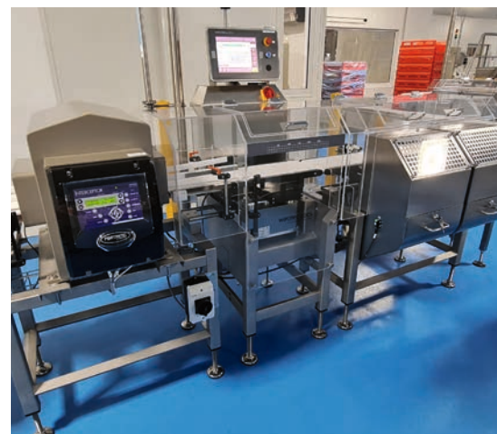
Metal detection, x-ray inspection, checkweighing, and serialisation systems for contamination detection, product recall prevention, quality and fill control, traceability and aggregation control for food, beverage, and pharmaceutical operations.