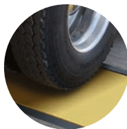
Government & Defence