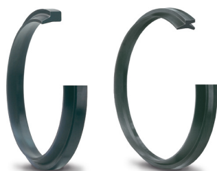
Merkel wiper P 6* and P 9* Featuring support elements or additional sealing function