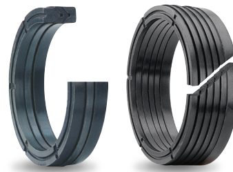
Merkel V-packing set EK resp. ES Particularly for cylinders in existing installations