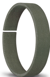
Merkel Guivex SBK and KBK, as well as the types SB and KB. Guide bands made of laminated fabric