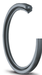
Merkel Radiamatic RPM 41 Radial shaft seal, particularly suitable for work rolls in steel mills

The basic rings come from the series production. Guide bands and V-packings are cut to size and supplied as open versions. A specially developed joining method allows individual diameter specifications for wipers, water guards and radial shaft seals.