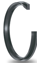
Merkel Enviromatic EA* Innovative water guard, re- places V-rings in demanding applications