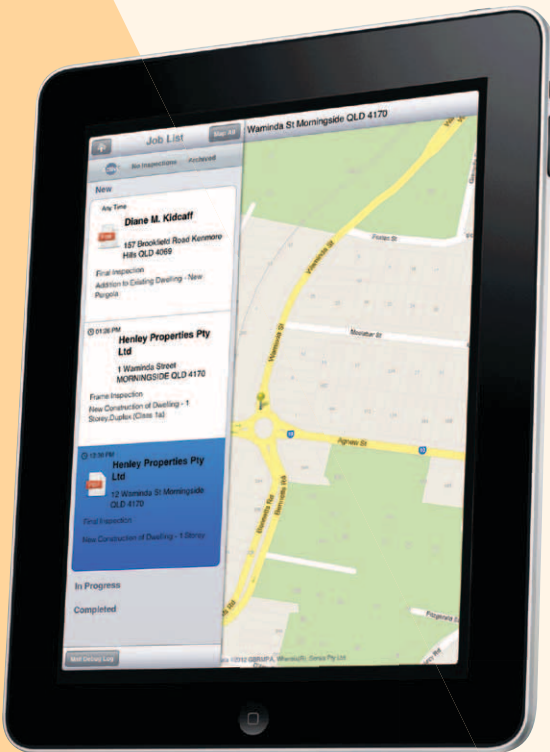
Our unique iPad app means you can enjoy Visual Approvals' efficiency on the go.

26% IMPROVEMENT IN PRODUCTIVITY OVER A 12-MONTH PERIOD.