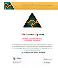
Australia Made Certificate