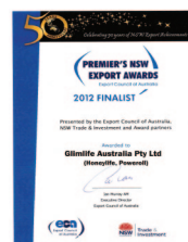
Export Award Certificate