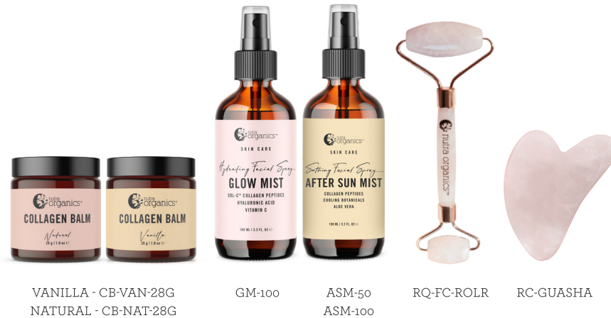
VANILLA - CB-VAN-28G NATURAL - CB-NAT-28G

Natural skin care formulations to protect collagen & promote glowing skin